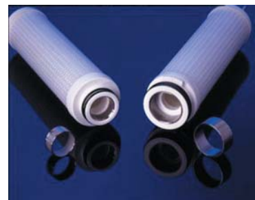
Stainless Steel Inserts

Efficiency, flow capability and service life are similar for all available constructions.